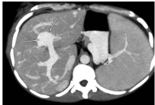
Figure 1. Contrast enhanced axial section showing aneurysmal dilatation of left branch of portal vein (arrows).

depicts the site, size, relation of the aneurysm with the vessels and its extension. 3 Color Doppler ultrasonography and magnetic resonance imaging can also depict the PVA accurately and can be used for confirming the finding. 4 CECT can also give accurate information regarding thrombosis, rupture or any other complication of the PVA. 5 Usually PVA are incidental findings, are asymptomatic and require no treatment. Serial follow up imaging can be done for assessing the PVA if needed. If the aneurysm is large or is causing symptoms due to its mass effect then it may require treatment. Medical management includes anticoagulation. Surgical management options include aneurysmorrhaphy, portocaval shunt, and mesocaval shunt. Serial imaging may be advised if PVA are stable and no complications are seen instead of going for surgical or medical treatment.